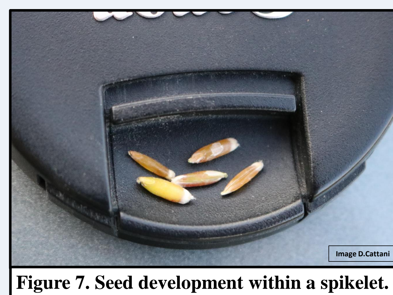
Figure 7. Seed development within a spikelet.