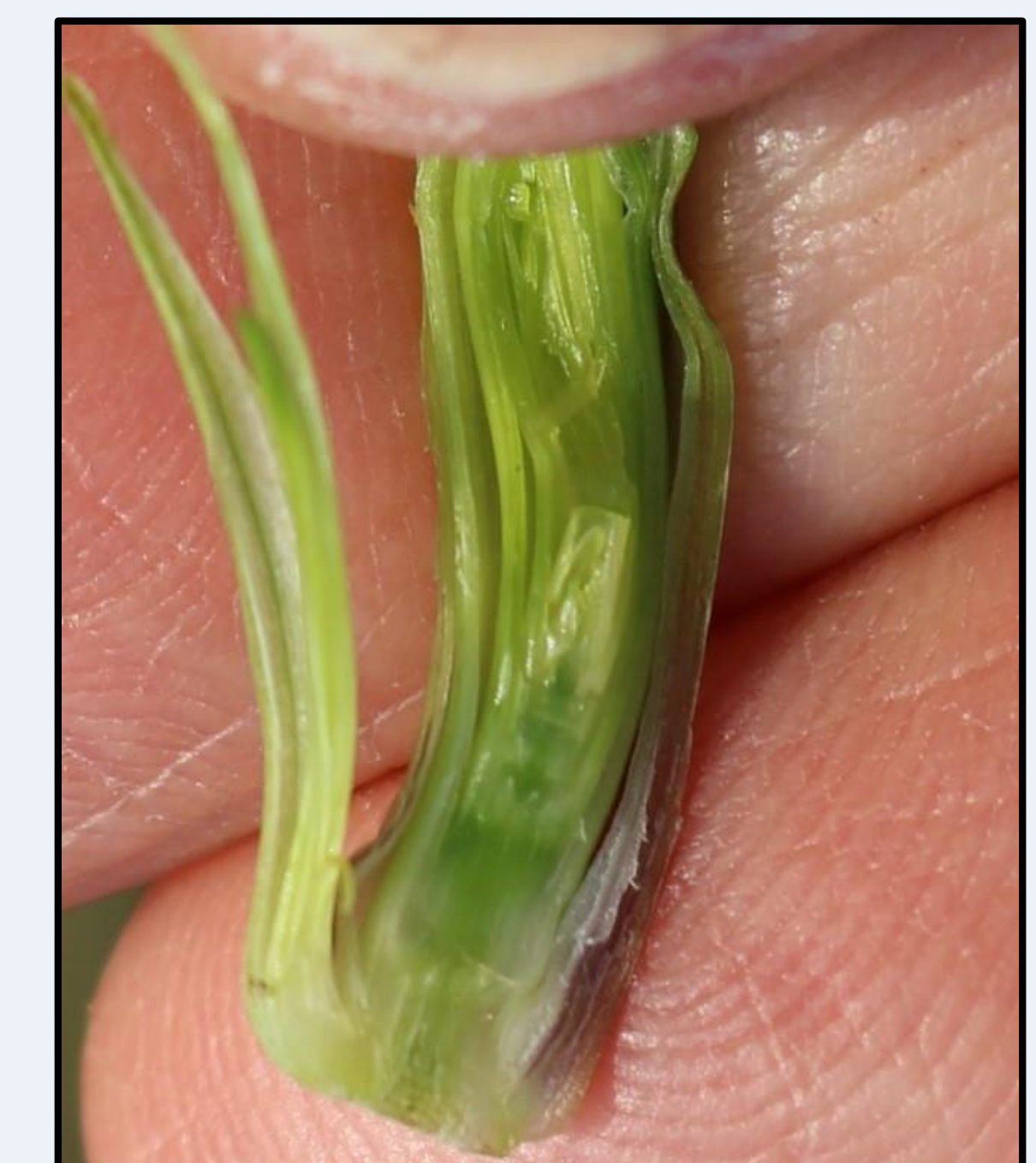
Figure 4: Pre-elongation of reproductive apical meristems.