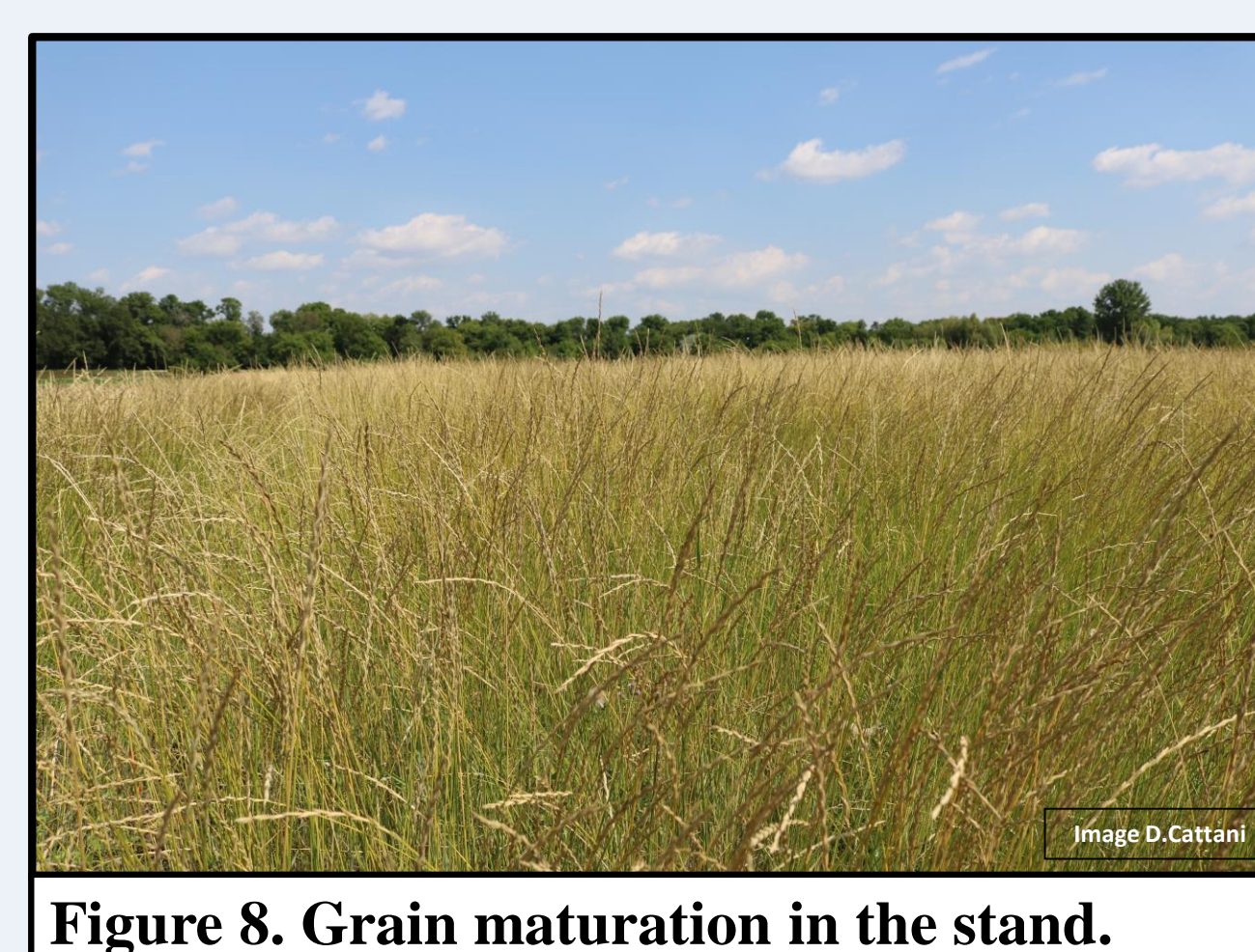
Figure 8. Grain maturation in the stand.