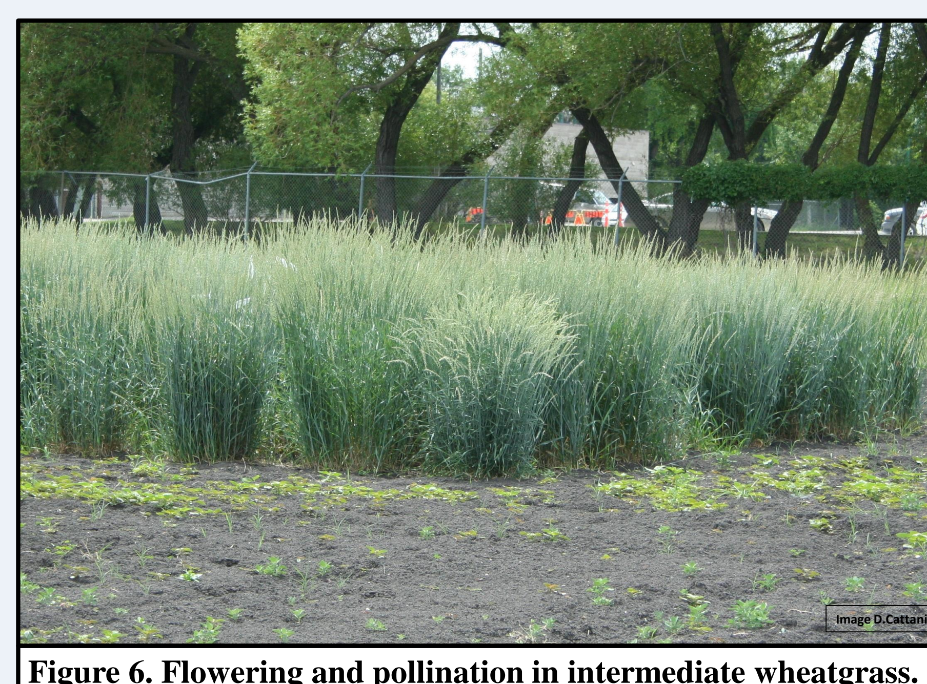
Figure 6. Flowering and pollination in intermediate wheatgrass.