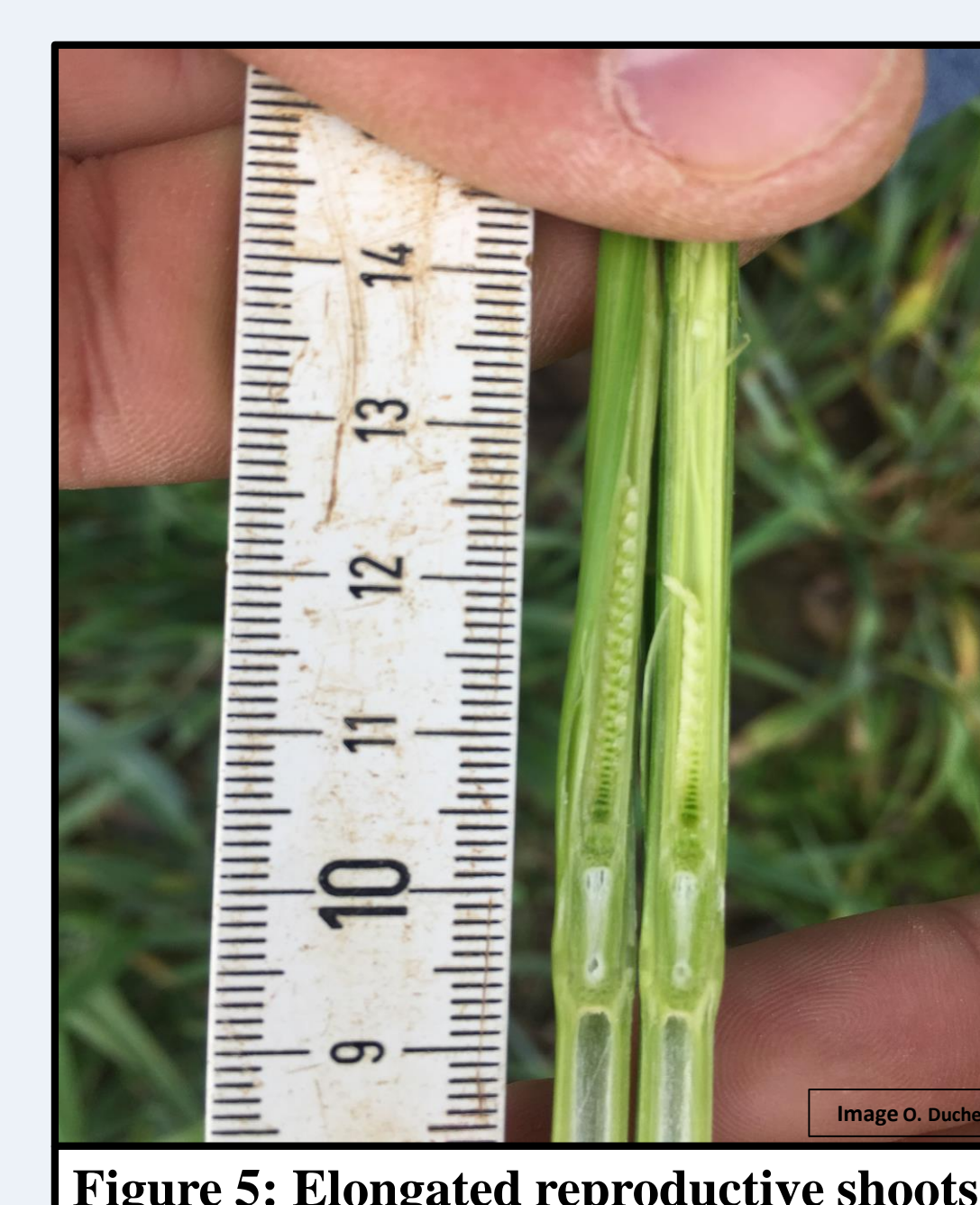
Figure 5: Elongated reproductive shoots.