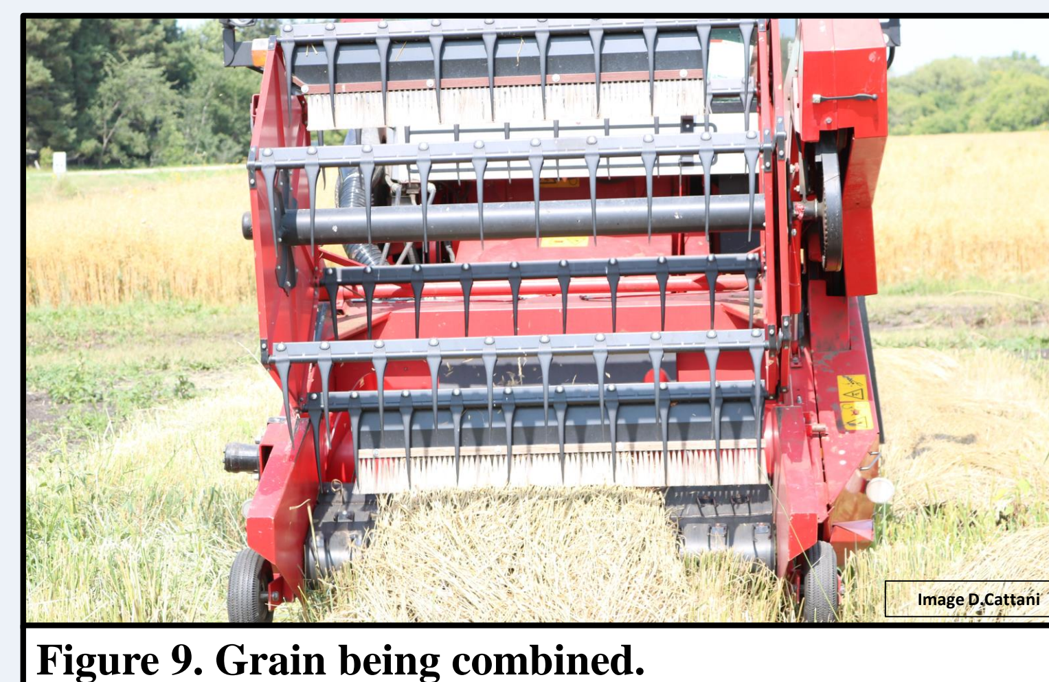
Figure 9. Grain being combined.

Conclusions: Reproductive tiller initiation day-length is most likely 13 hours and gdd base T is possibly 3° or 4°C (for Manitoba). This will be refined as we accumulate more data on adapted germplasm and with additional year-to-year variability. Data from other growth environments will likely provide the conclusive evidence. A gdd x precipitation interaction in the fall regrowth period in Manitoba requires a much greater volume of work to allow for resolution.