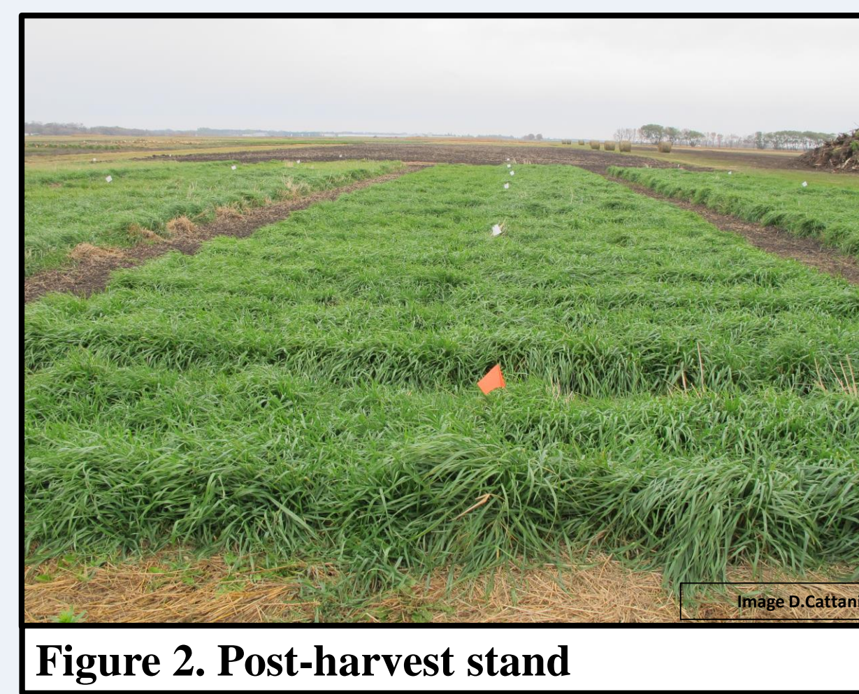
Figure 2. Post-harvest stand