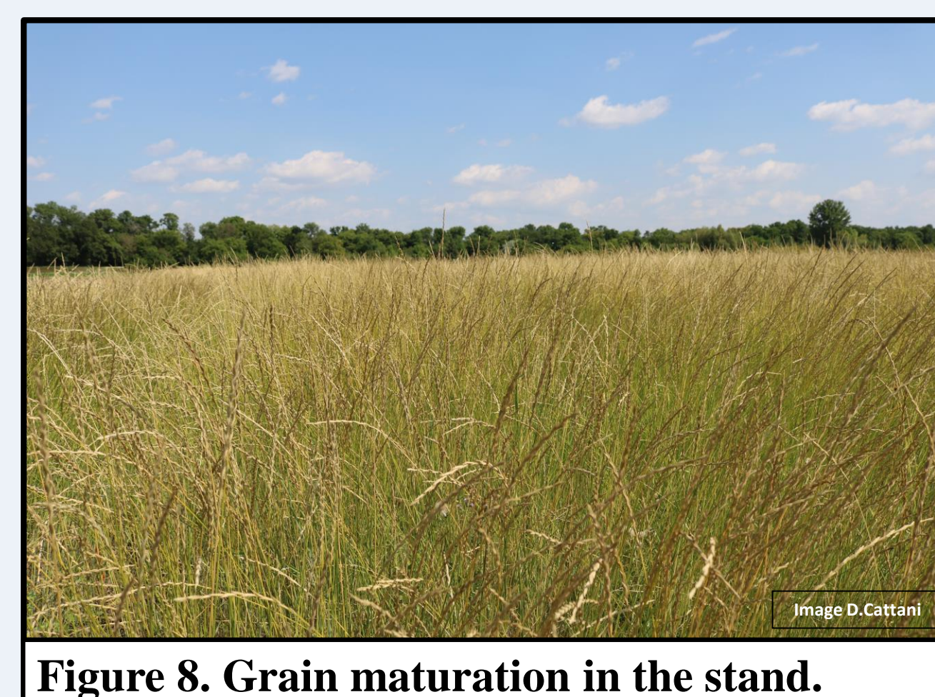
Figure 8. Grain maturation in the stand.