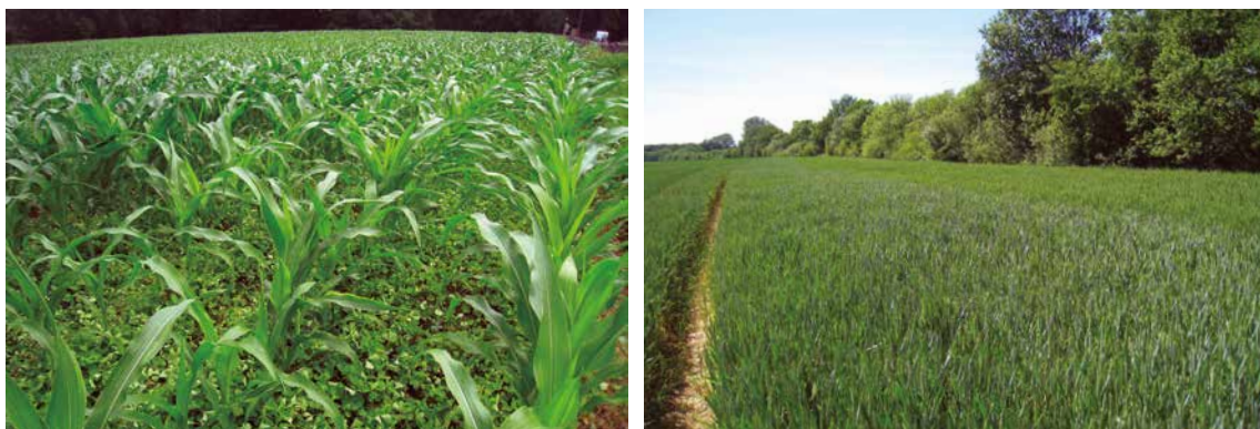
Figure 2. Maize-clover intercropping (left) and semi-natural landscape elements in an agricultural landscape (right).

In respect to conservation biological control, if we now apply a buffer zone of, for example, 100 m around the existing seminatural landscape elements (Figure 4), areas can be delimited where management would be most beneficial, e.g. in zones 3 and 5, which have a low number and cover of seminatural landscape elements (Figure 3). In the present example 100 m was taken, representing a distance over which more mobile natural enemies would be able to move. In contrast, less mobile natural enemies would normally not be able to move beyond a distance of 50 m or less.