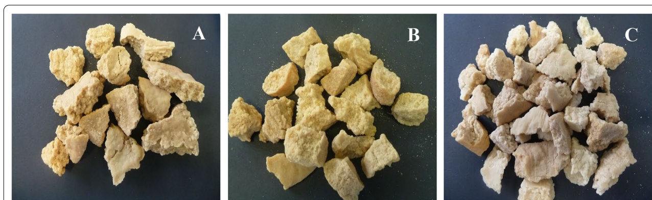
Fig. 2 Appearance of Klila cheese following the used milk. A: Klila made with goat milk. B: Klila made with ewe milk. C: Klila made with cow milk

In fact, depending on the season, the curd can be obtained in two different ways. Extreme