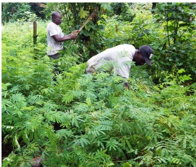
Figure 2. Example of homegarden agroforestry in Cameroon

Due to the high rate of forest cover in Cameroon, there exists a strong ethnic tradition of food sourcing from wild trees in forests and forests edges for a variety of products; food, fuel, fibre, fodder, and building material.