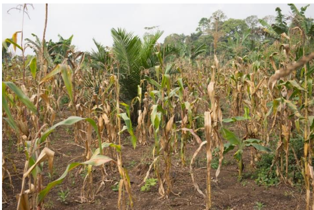
Figure 4: Oil palm intercropping with maize

Intercropping is another method employed in agroecological farming systems in Cameroon. The primary food security benefits of intercropping include greater overall output per land area and improved yields through beneficial plant interactions, both of which increase yield and therefore food availability (Figures 3 and 4).