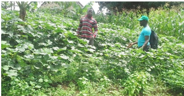
Figure 3: Okra intercrop with a variety of crops

Intercropping is another method employed in agroecological farming systems in Cameroon. The primary food security benefits of intercropping include greater overall output per land area and improved yields through beneficial plant interactions, both of which increase yield and therefore food availability (Figures 3 and 4).