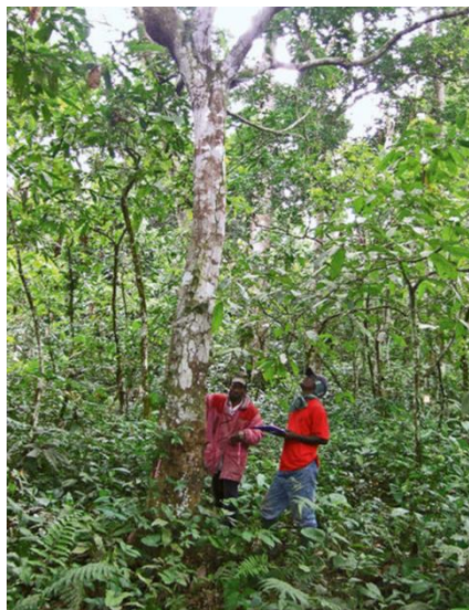
Figure 5: Cocoa with tree intercropping (pseudo-agroforestry) (cirad.fr)