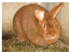
Rabbit « Fauve de Bourgogne » (type I) adapted to a traditionnal breeding system

Other populations are still selected and the frozen biologic material represents a selection control to measure genetic progress precisely. Moreover, for security, several populations commercially spread are subject to regular cryoconservation in order to save the selection core from a sanitary risk (Inra 2066, commercial lines of Hypharm and Hycole societies...)