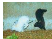
Rabbit “Sauteurs d’Alfort” (type II). They move on forelegs when they are stressed