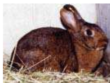
Rabbit « Brun Marron de Lorraine » (type I), endangered breed