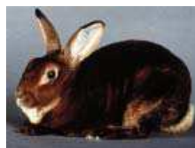
Rabbit « Orylag® castor (type III) bred for its “Rex” fur